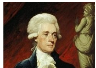
All Intelligent People in History Disliked Jews