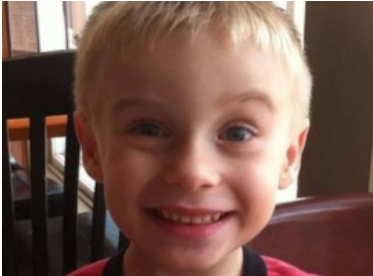
Judge Orders Mother Held at Gunpoint for Refusing to Mutilate the Penis of Her 4-Year-Old Son