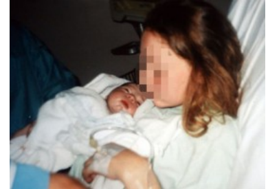
Oxfordshire: Girl Bleeding from the Crotch After Moslem Gang-Rape was Turned Away by the Police