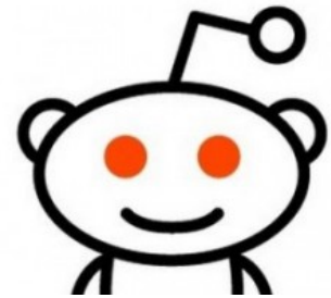
Reddit is Fertile Ground for Recruitment