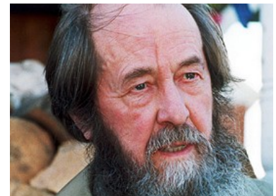
Aleksandr Solzhenitsyn: Why was His Final Book Never Translated into English?