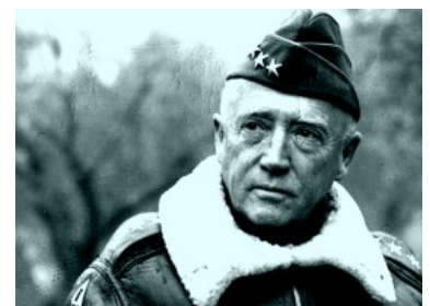
General Patton's Warning About the Jews and Their Treacherous Allies